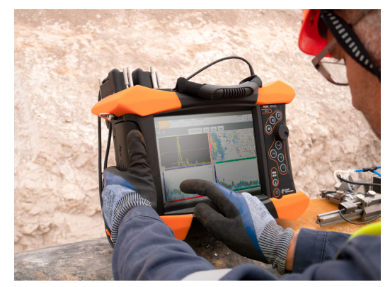
In-field inspection using M2M Gekko