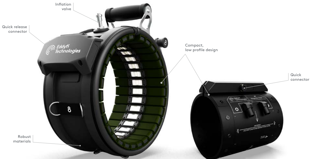
PIEZO TOOLING 6 - 72 inch

Sonyks is an incredibly versatile system that allows operators to address more applications thanks to short-range and medium-range capabilities in addition to long-range ultrasonic testing. For example, use the new 128 kHz magnetostrictive collar to inspect flanged pipes efficiently.